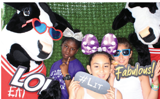
Kiddos getting silly with Chick-Fil-A mascots

For photos of the event, please visit https://www.facebook.com/florgantransplant.org .